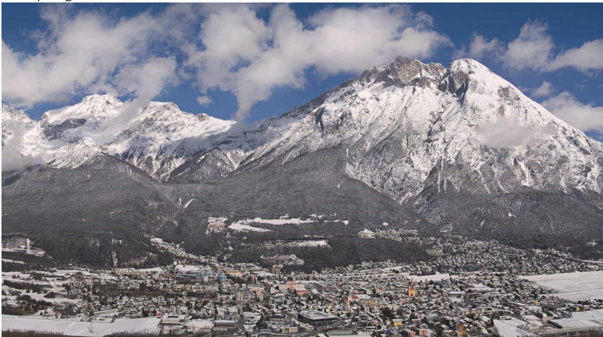
Telfs is located in a basin-like extension of the Inn Valley at the foot of the 2,662-meter-high mountain called Hohe Munde.

In Tyrol, tourism is even the central economic factor. Tyrol accounts for one third of all overnight stays in Austria. Winter is the strongest season, which is caused by the many ski resorts. Probably the best known is Kitzbühel, where the legendary Hahnenkamm race with its notorious Streif downhill run is held every January and is broadcast on television worldwide, ensuring high viewing figures. In summer, on the other hand, the mountains are ideal for hiking and cycling tours.